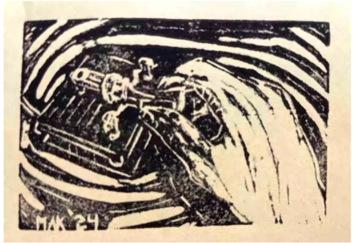
Solo Flight (1961)

I soloed in a 65-horsepower 'Aeronca Champ' from LaFleur Airport, Northampton, MA in 1961. As a member of the UMass Flying Club, it only cost $12/hr, but even that was too expensive, as I was earning about $15/wk as a graduate teaching assistant. I intended to be able to use my own aerial photos to interpret geology from the air. This conveys that memory.