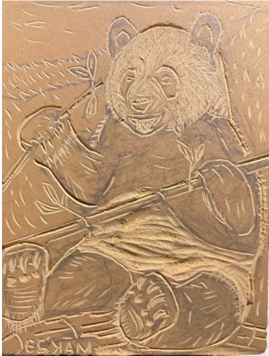
Shown Last Month

Green colored pencil coloring will be used for the bamboo leaves, after printing with black ink on white paper.