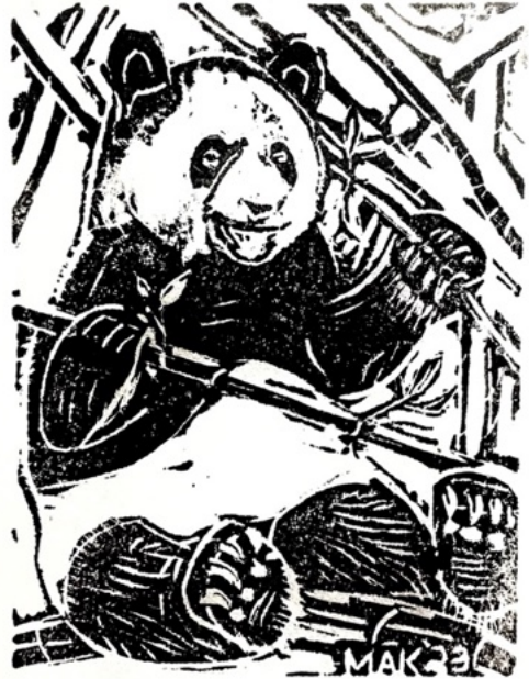
Now Printed in Blue