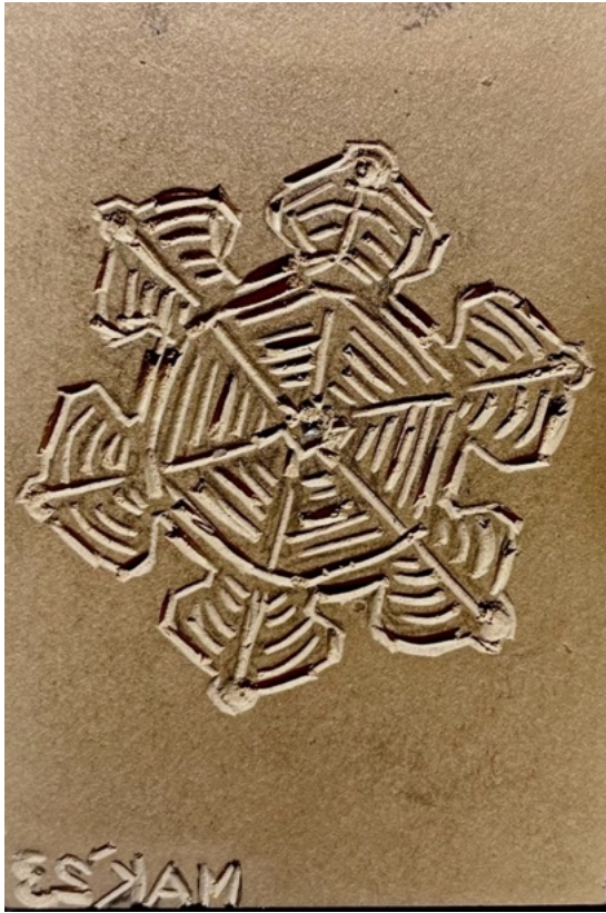
Another Carved Block